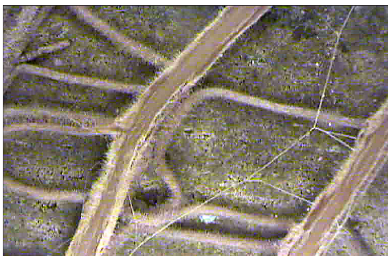
Fig. 3. Olive tree cv. Barnea images.

At the Research Institute of Horticulture (RIH), the technique of observing root systems with minirhizotrons was introduced in 2007 for