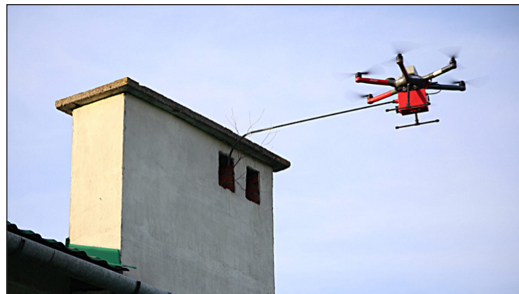
Fig. 5. Demonstrator taking a sample from a chimney opening 2