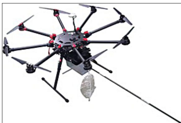
Fig. 1. Commonly used unmanned air or exhaust fume composition testing system, source: [9]

The fact that the solution presented above is used as the most common one is confirmed by a market review of unmanned aerial systems for air quality analysis. Apart from the DR1000 Flying Laboratory design shown in Figure 1, a similar solution is available in, among others, the following constructions: DR2000 [10], United Systems SOWA [11], SoftBlue AirDrone [12], and Pelixar AAMS [13]. Among the proposals of unmanned aerial vehicles for air composition measurements available on the market, it is currently impossible to find any other type of solutions, in particular - a solution that allows taking an air sample directly from an emission source.