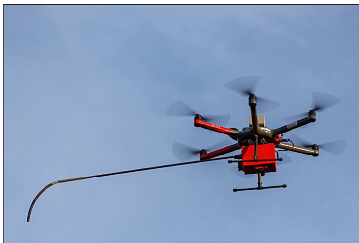
Fig. 2. Demonstrator of the measuring probe for testing of emission source exhaust fume composition

The tests were performed for various types of chimney openings commonly used in households. During all the tests performed, the mixture was sampled efficiently. Within the framework of the performed trials, no cases of ineffectiveness were found for the proposed solution.