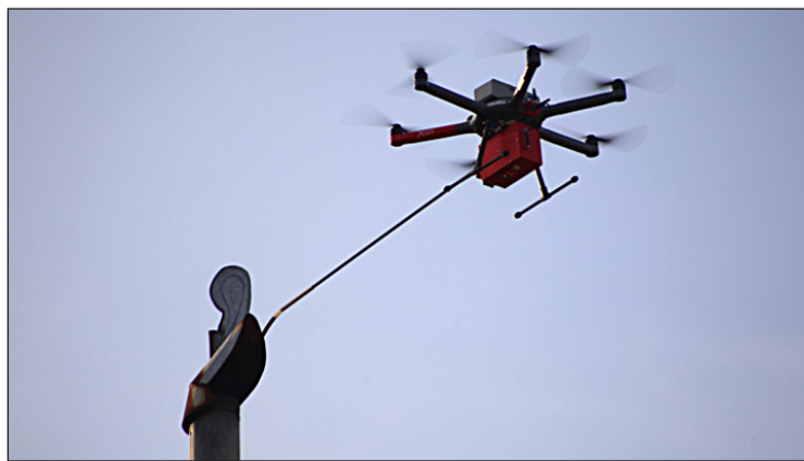
Fig. 4. Demonstrator taking a sample from a chimney opening 1