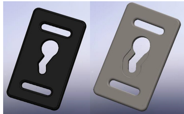
Fig. 1. Original (left) and modified (right) design of a clip for slings in medical lifts

The second aim of the studies presented in the paper was to check if the use of additive manufacturing technologies is an effective way of assessment of a new project of a sling. Modification of an original model of a part was proposed (Fig. 1) to increase safety of use of a sling by more stable mounting on a lift hanger. To verify mechanical