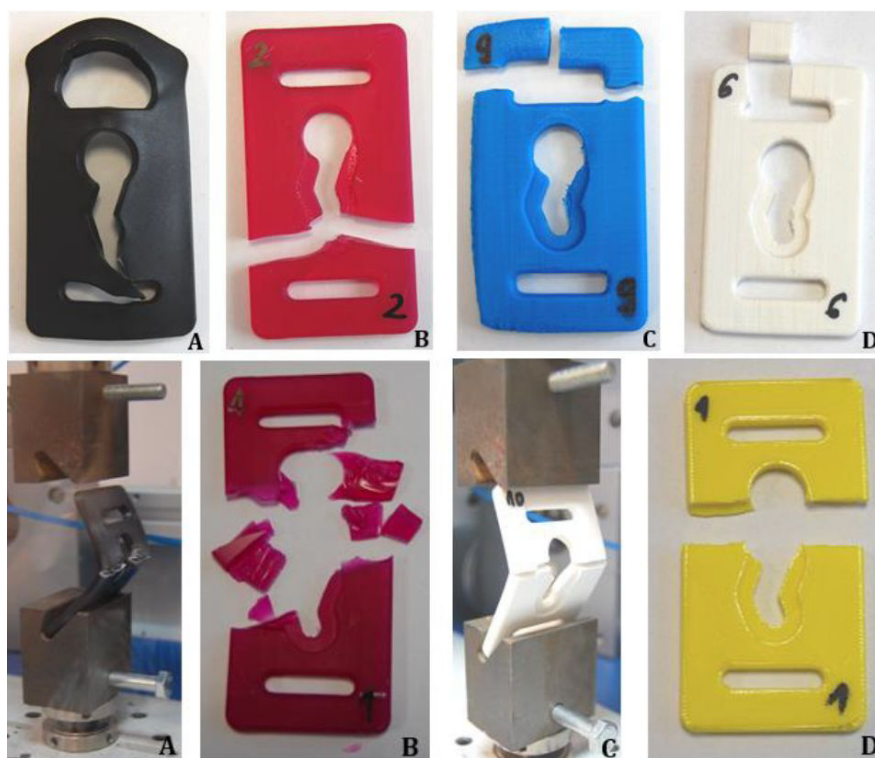
Fig. 5. Clips destroyed in tension tests (top) and bending tests (bottom)

lems with accuracy (revealed in the assembly process at the stage of usability tests), despite layer thickness being much lower than in the FDM process,