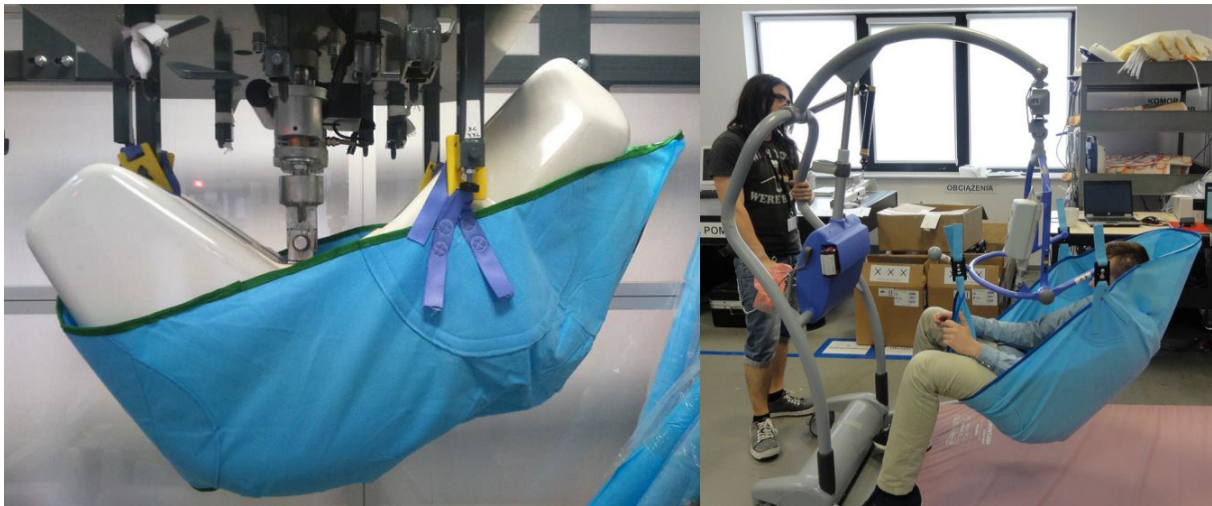
Fig. 4. Loading and usability tests

In case of visible damage of material, stitch or a clip itself, a given test is marked as failed [13].