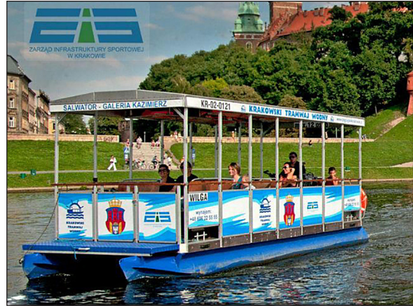
Fig. 8. Krakow water tram [22]