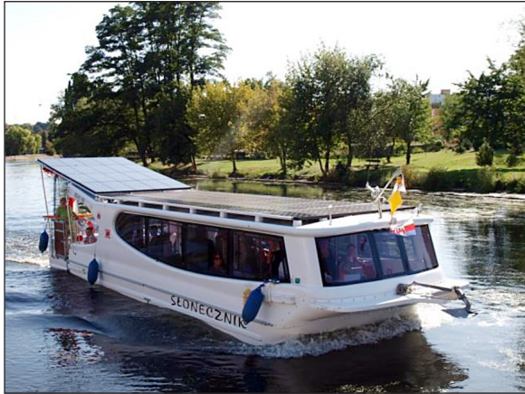
Fig. 7. Two solar-powered ships “Słonecznik” and “Słonecznik II” [21]