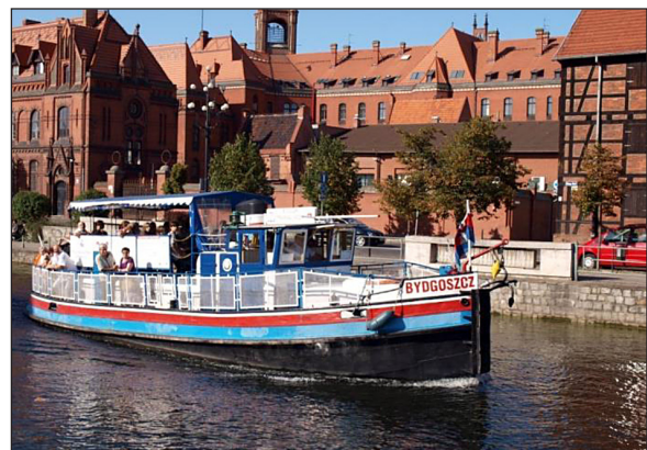
Fig. 6. Historic motor powered ship m/s Bydgoszcz [20]

tions adopted in Bydgoszcz, Gdansk and Krakow were placed in the table in condemning whether the factor is closer to the solution adopted in the transport and tourist transport. The data from the analysis are summarized in Table 2.