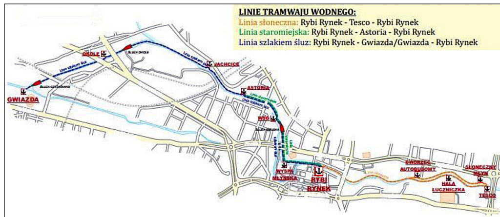
Fig. 3. Water tram line diagram in Bydgoszcz, along with stops [12]