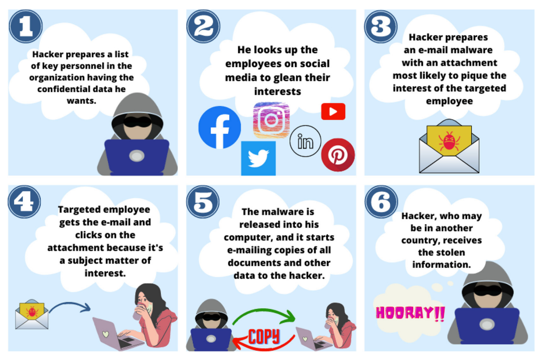
Figure 2. Typical anatomy of a spear phishing attack

victim's profile can be created. Figure 3 shows a real example of spear phishing with a political thread. Hackers are expanding their attacks on Tibetan activists and employing increasingly sophisticated virus delivery mechanisms. Following these spam efforts, Fire Eye analyst Alex Lanstein has discovered an unusual example of such a malicious email. The attacker gathers much information from the victim's social media. The attachment of an email message had a suspicious file with backdoor malware. The attacker encouraged the victim to open the infected attachment [30, 31, 32].