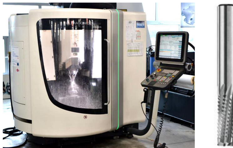
Fig. 1. Rotary ultrasonic machine tool and milling cutter for composite materials

Each measurement of the delamination factor, as well as surface roughness, was repeated three times. However, only the average values were recorded in the table. The delamination factor is labelled as D_f and it is calculated as the percentage difference between the reference width of the groove and the real width of the groove, which is usually greater than the reference width. The principle is illustrated in Figure 4 and expressed by formula (1). The average ( Ra ) and maximum ( Rz ) values of the roughness were selected as the surface roughness parameters.