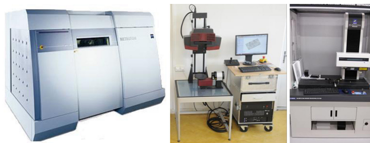
Fig. 2. Measuring devices [16, 17]: a) Zeiss Metrotom 1500, b) GOM ATOS II TripleScan, c) Zeiss Surfcom 5000

The obtained and evaluated results of measuring the delamination and comparison of the results between both types of reinforcing fibres of the polymer composites enabled to conclude that the value of delamination is affected by the reinforcing fibre material. A lower delamination factor was observed during the machining of GFRP (lower by 74% in comparison with CFRP). The worst value of the all was achieved